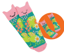
Axolotl Socks 250+ boxes