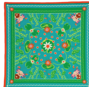
Bandana 108+ boxes