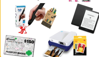
OR 3D Printing Pen & Refill OR Digital Instant Camera & Film OR Kindle OR $150 Passport Bucks