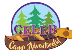
C.E.L.E.B. Camp Adventureful AND Patch 850+ boxes