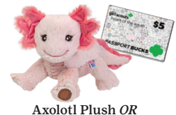
Axolotl Plush OR $5 Passport Bucks 420+ boxes