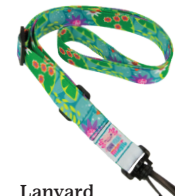
Lanyard 150+ boxes