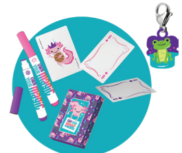
DIY Playing Cards & Frog Charm 200+ boxes