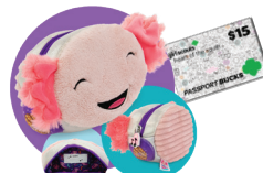
Axolotl Pouch OR $15 Passport Bucks 650+ boxes