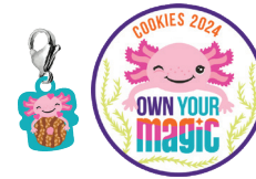
Axolotl Charm & Theme Patch 375+ boxes