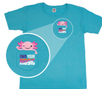
Theme T-Shirt 325+ boxes