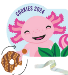
Action Patch AND Apron