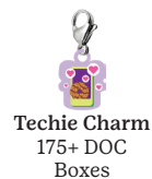
Techie Charm 175+ DOC Boxes