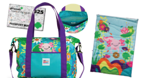
Weekender Tote OR Blanket OR $25 Passport Bucks 1,000+ boxes

Passport Bucks may be used to pay council-sponsored program activities and/or travel fees, and to purchase items in the council shop. Passport Bucks may also be used to pay resident camp registration fees and resident camp trading post for the summer session of 2024 within the resident camps provided by Girl Scouts Heart of the South. Passport Bucks may not be cashed for "real money," are non-transferrable, have no value outside of Girl Scouts Heart of the South, and expire on 9/6/24.