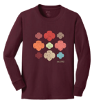
Multi-Color Trefoils Long Sleeve Shirt 228+ boxes initial order