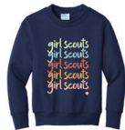
Girl Scouts "On Repeat" Sweatshirt 456+ boxes initial order

Apparel and ink colors subject to change due to availability at time of order.