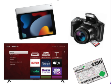
Apple iPad OR 50" Smart TV OR Digital Camera OR $350 Passport Bucks