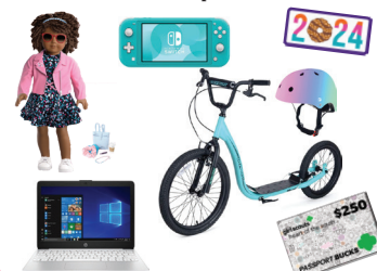
2024 Patch AND American Girl Doll – Create Your Own OR Laptop OR Nintendo Switch Lite OR Electric Scooter & Helmet OR $250 Passport Bucks