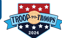
T2T Patch 12+ T2T boxes