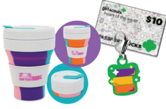
Collapsible Cup & Cookie Charm OR $10 Passport Bucks 500+ boxes